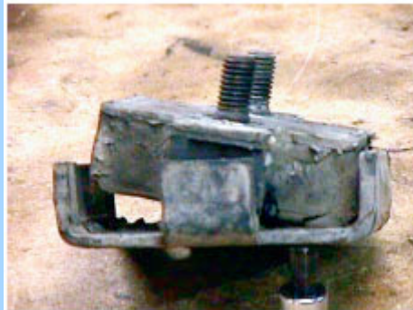
Illustration 3 - Bad Engine Mount