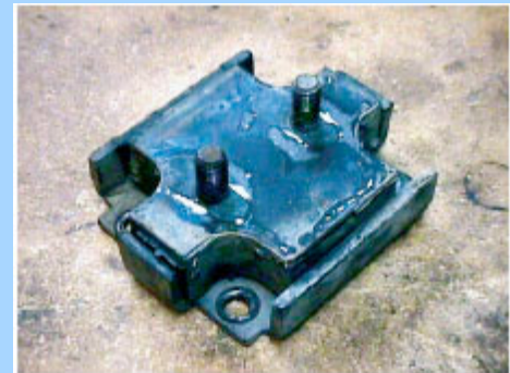
Illustration 1 - Engine Mount